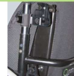
Split mounting hardware Code: SMH