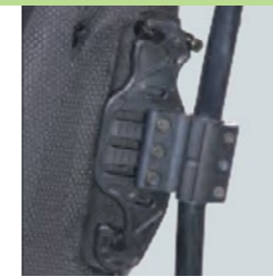
1/8" mounting hardware for posture back with canes Code: PBMH-Q