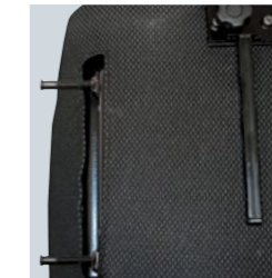
Extended mounting pins Code: EMP