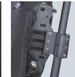
Heavy duty "Easy Set" mounting hardware Code: HDMH