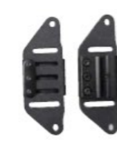
FIXED SPACE SAVER MOUNTING HARDWARE (PAIR) Permanent mount recommended for Power Wheelchair application or when portability is not required.