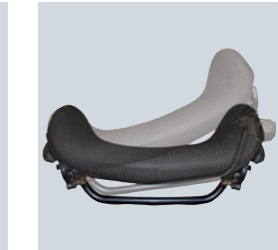
Rotation Back may be oriented to accommodate pelvic/trunk rotation