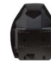
REMOVABLE MOUNTING KIT FOR POWER TILT/RECLINE Available for Matrx PB & Elite Heavy Duty Backs exclusive of PB Deep Heavy Duty.