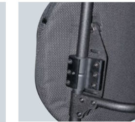
Fixed space saver mounting hardware Code: FSSH