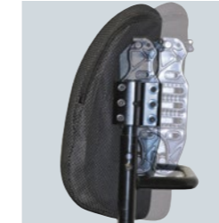
Depth Adjusts 2" (5cm) behind back canes