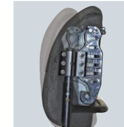
Angle 20° anterior range of back angle adjustment in front of back canes