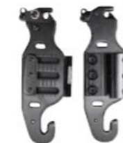
HEAVY-DUTY EASY SET HARDWARE (PAIR) Fits 3/4", 7/8" and 1" back canes. Code: HDMH