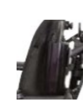
ESR MOUNTING HARDWARE Allows heavy-duty PB & Elite Backs to be mounted to Motion Concepts TRX Power Positioning with ESR. Code: ESRMH-HD