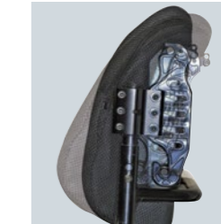
Angle 20° posterior range of back angle adjustment behind back canes