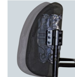
Depth Adjusts 2" (5cm) in front of back canes